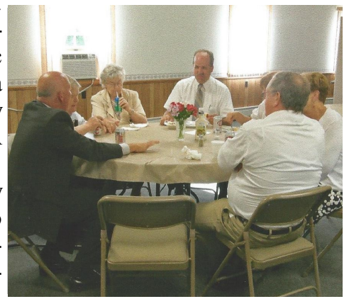
Serious Discussion Going On!

The retreat is a great way for our missionary family to renew fellowship with one another and recharge their spiritual "batteries" for ministry.