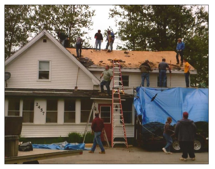
Volunteers re-roof the church parsonage