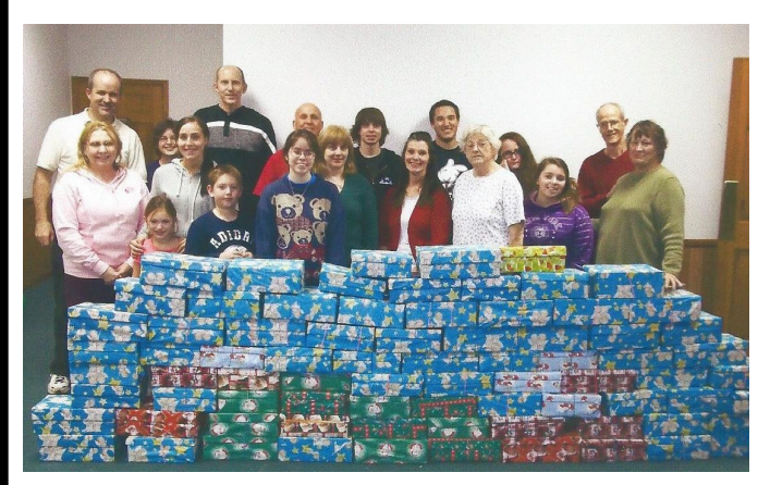
Boxes All Filled for Operation Christmas Child Olcott Bible Church