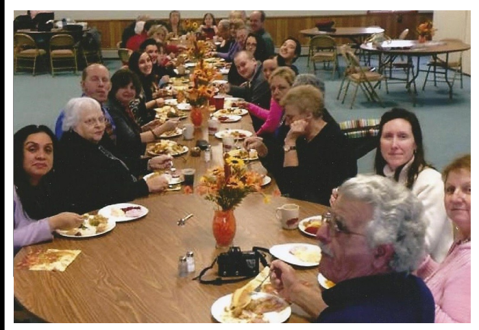
Great Harvest Dinner Olcott Bible Church

The harsh winter weather did not hinder the mission churches from having a variety of activities that warmed the hearts of everyone and provided many opportunities to share the gospel with friends and neighbors. Through pictures, we share some special moments.