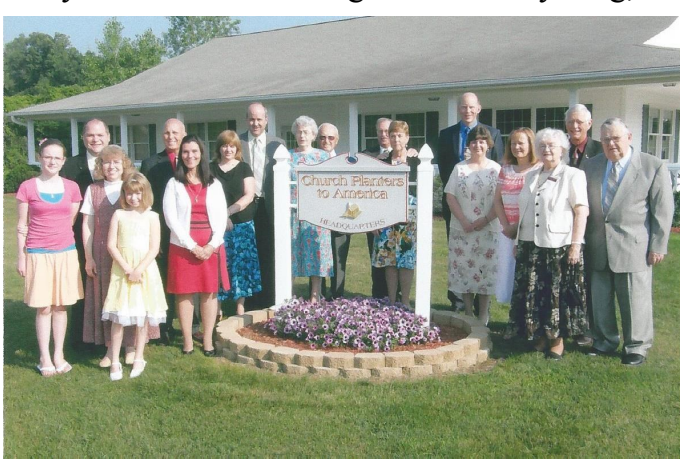
C.P.A. Missionary Family

In order to make it all possible, we need many individuals and churches to pray for God's blessing on this special time. We, also, need people who will give a special gift for the expenses of the retreat and for the travel of everyone. With the rising cost of everything, we are trusting God to provide