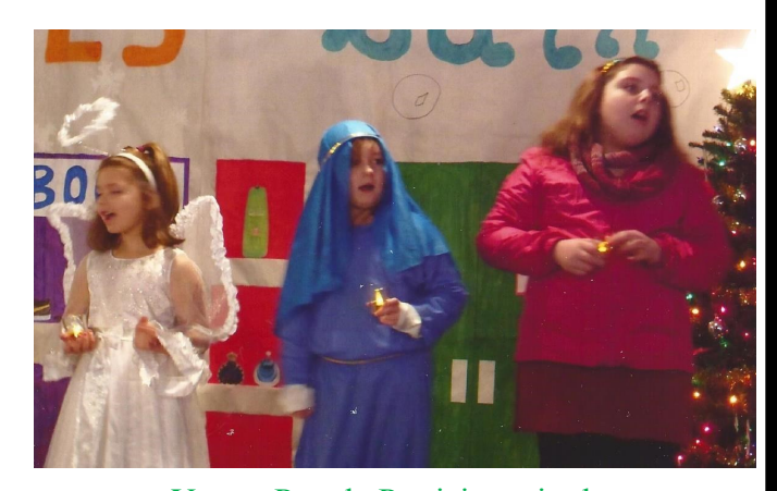
Young People Participate in the Christmas Program St. John Bible Church