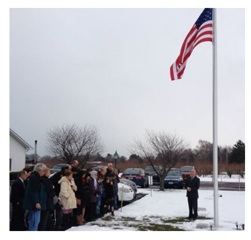
Dedication of Flag and Pole Olcott Bible Church