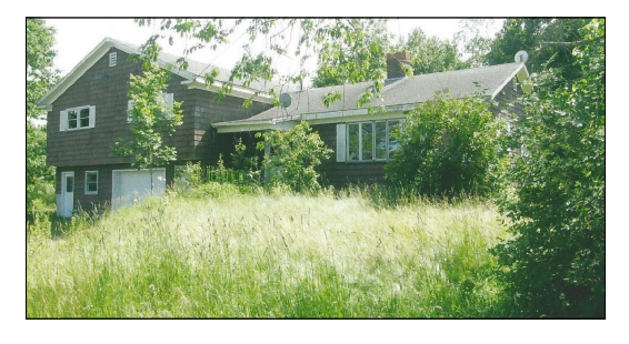
Parsonage Before Work Began

Pray for people to be saved, for the church to grow, for the Ruggerios financial support to increase to a livable level and for God to be blessed. It is located just across from Hannaford grocery store, just off Route 1.