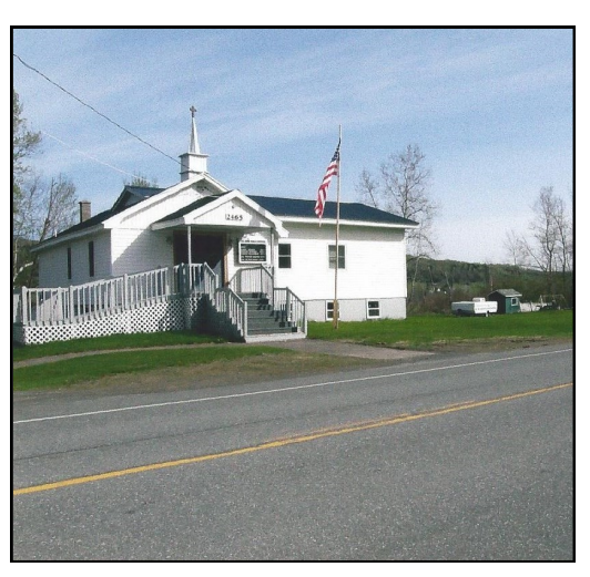
St. John Bible Church