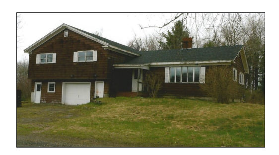
Parsonage After Cleaned Up