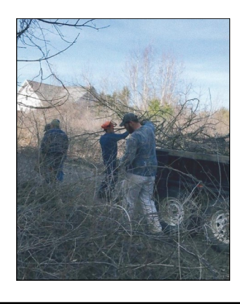
Men Cleaning Property