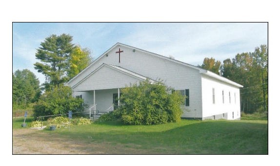
Emmanuel Baptist Church