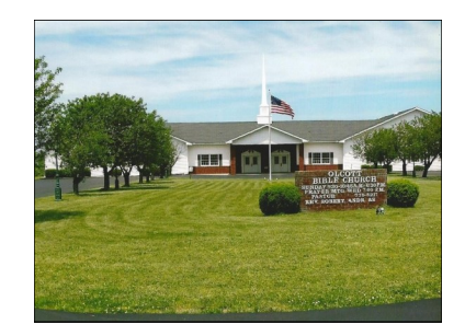
Olcott Bible Church