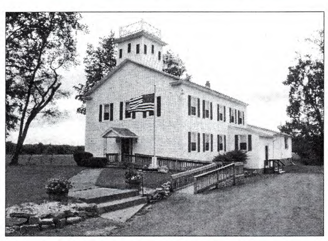
New look at Dennison Corners Community Church