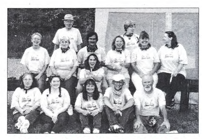
Helpers for V.B.S. at Berean Bible Church, Groveland Station, NY