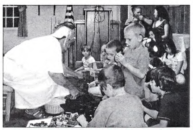
Children Enjoying V.B.S. in Brooks, ME