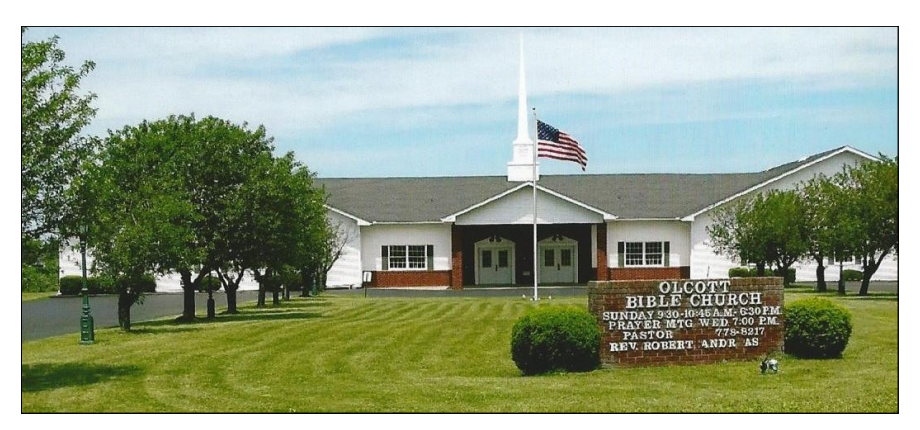
Olcott Bible Church Olcott, New York

Please pray for these situations. We are looking to God for great things in Olcott, Portageville, and Belfast.