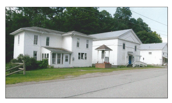
Parsonage, Church, and Youth Building Portageville Community Baptist Church Portageville, New York