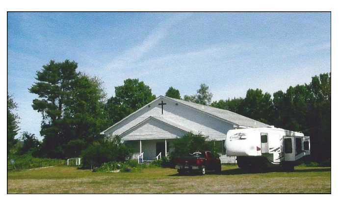
Emmanuel Baptist Church Belfast, Maine