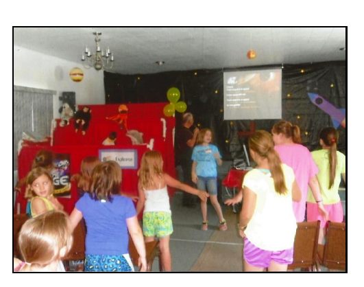
Children & Puppets During a Motion Song