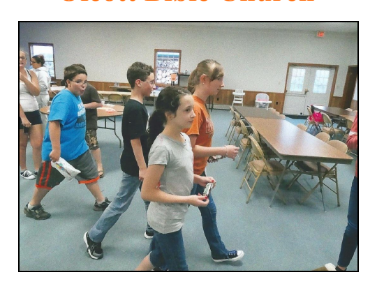
V.B.S. in Olcott