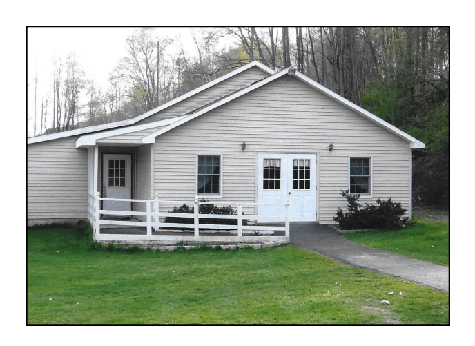
Temple Baptist Church