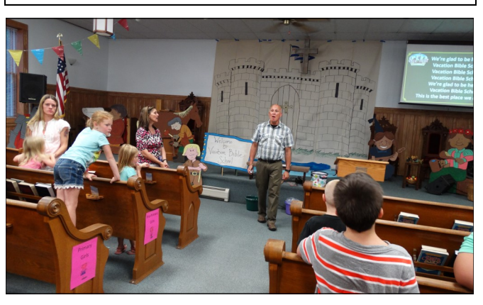
Community Baptist Church Portageville, New York Song Time at V.B.S.!

A highlight of the week was the missionary offering each night. The total given was $700. This was given in pennies which weighed 260 lbs. The money was sent to Mission Haiti Helping Kids. They minister to children in Haiti.