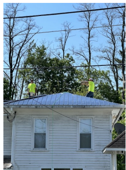
New Metal Roof

Old buildings need some tender loving care. Often, as missionaries start a new work in small town America the facilities may have been run down over the years and what is necessary is resources and resolve to make things look better. When we first arrived here in Portageville, we knew one of the first things we needed to do was to put a steeple on top of our building. Praise God this was only the beginning of what the next few years would entail and continue to this day. The exterior of the church was completed last fall and this summer we had to address an old roof on the parsonage. We were able to hire this out and got the roof done efficiently. The folks at the church want their buildings to look great for the community. We were going to paint the parsonage but decided to put on vinyl siding instead. We will begin this project soon. Our fellowship hall, which was a Methodist church many years ago, needs some