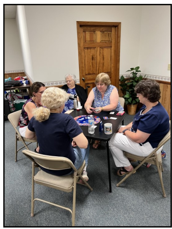
Ladies Having Some Fun