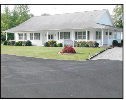
C.P.A. Headquarters Building