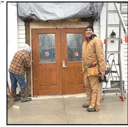
New Doors Installed