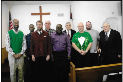
Little Creek Baptist Church