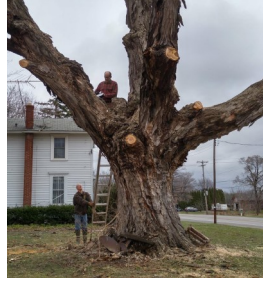
Olcott Men Cutting Fire Wood

It is estimated that the church saves about $10,000 per year in fuel costs. This money can now be used for ministry and missions. "Great job men!"