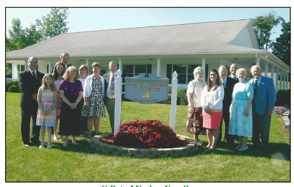
C.P.A. Mission Family

Throughout the week testimonies, good Bible preaching by our missionary pastors, special music and a variety of activities will be enjoyed by all. It is always a blessing to share ministry and family experiences. Church Planters to America is a family of people who have been called to help revitalize churches that are going through difficult times.