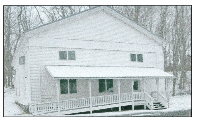
Church Youth Building