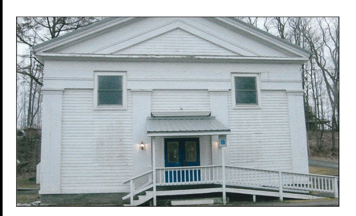
Portageville Baptist Church Changes Coming!

Pray for their V.B.S., July 9-13, for souls to be saved and for new families to be reached.