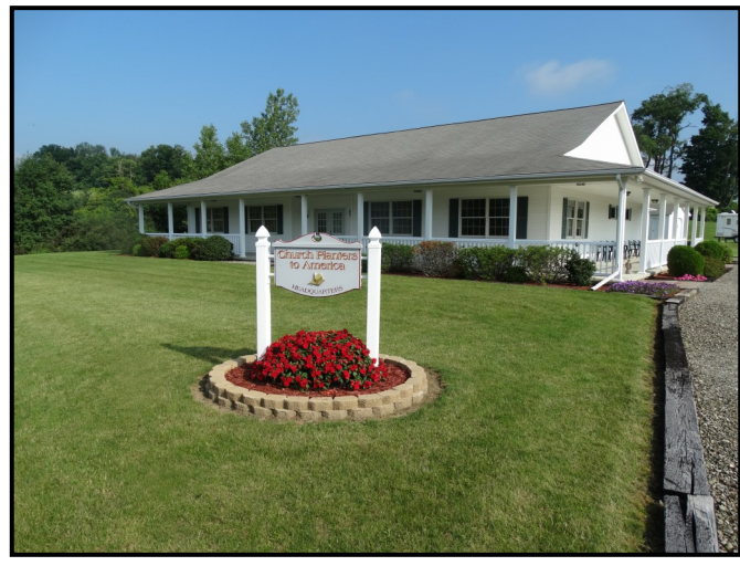
C.P.A. Headquarters Building Almond, NY

Now that the house has been sold and we have no one on site to look after the building and grounds we felt it wise to sell the property and locate the mission where the director lives. This will free up much overhead and we can continue to do the work God has called us to do. One prayer request that has been asked time and again is for God to send men and their families to be a part of C.P.A. We need to be faithful to the call God has placed upon us to strengthen the local church. Please be in prayer over this entire endeavor. Thank you!