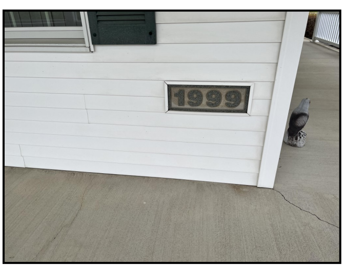
1999 – The Year Headquarters was Built