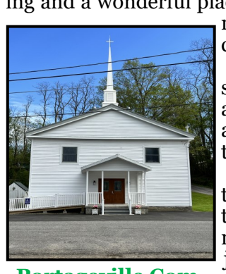
Portageville Community Baptist Church

Please let us know if you have a change of address, it will save us postage. Thank you!