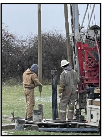
Root Well Drillers

When the mission family heard that the Buckley's home would be sold, we needed to take action on one item. When Church Planters